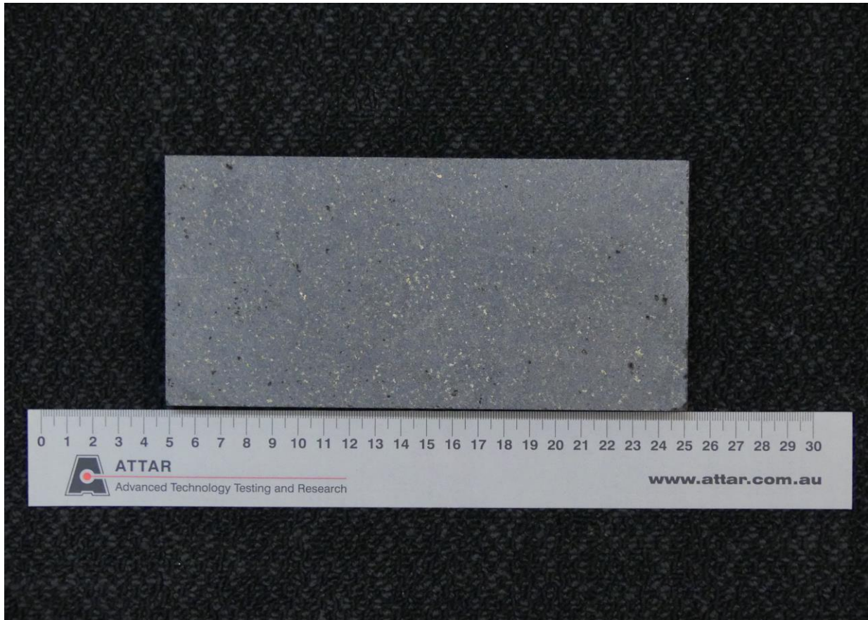
Figure 1: Bluestone Honed tile